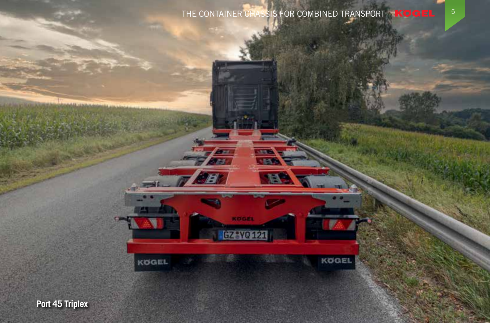
Port 45 Triplex