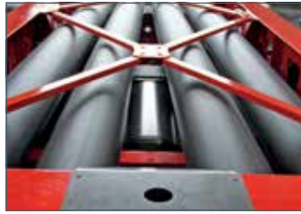
Stowage for hose pipes