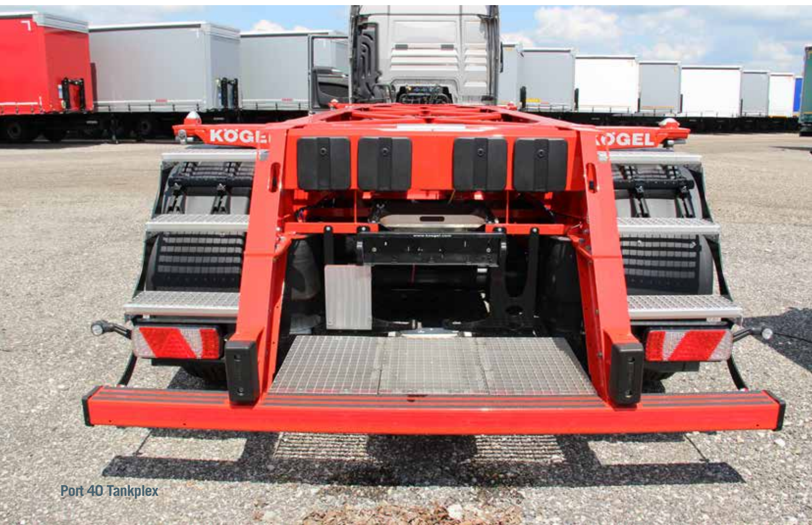
Port 40 Tankplex