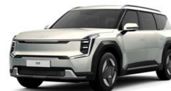
Ivory Silver Earth