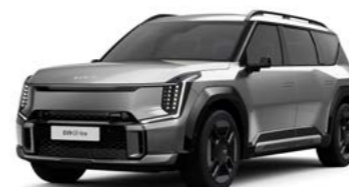
Pebble Grey Earth, GT-line 6/7 Seat