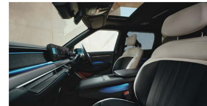
GT-line - Two-tone Vegan Leather