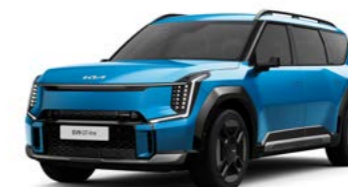
Ocean Blue GT-line 6/7 Seat