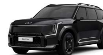
Aurora Black Pearl Earth, GT-line 7 Seat