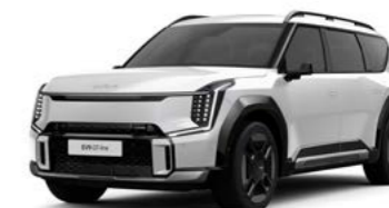
Snow White Pearl Earth, GT-line 7 Seat