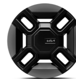
GT-line - 21" Alloy Wheel