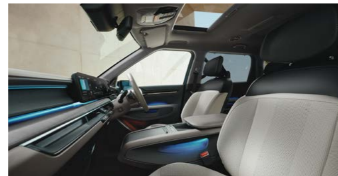
Earth - Two-tone Vegan Leather